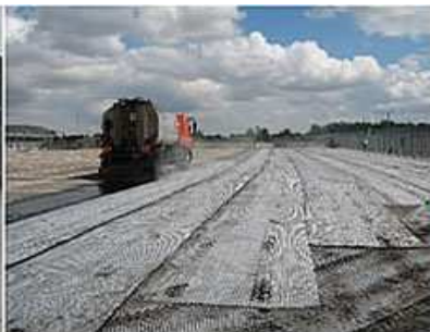
160/220 pen bitumen layer sprayed at 160° at a rate of 1.1 l/m 2