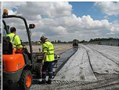
Glasstex applied to entire area