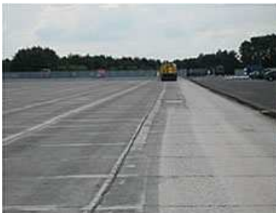
Joints cleaned, edge planed to tie in levels and surface swept clean of loose dust and debris

After filling the potholes Glasstex® paving composite was installed on to the existing concrete before laying a 40 mm thick asphalt overlay. The Glasstex is designed to inhibit the propagation of reflective cracking.